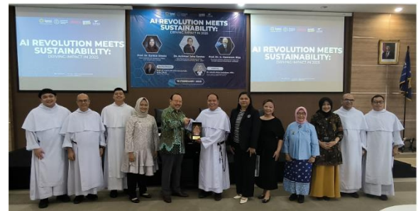
Image 2. With the IPMI Institute, Jakarta & UST Angelicum College, Manila, Philippines