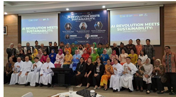
Image 1. With All Audience