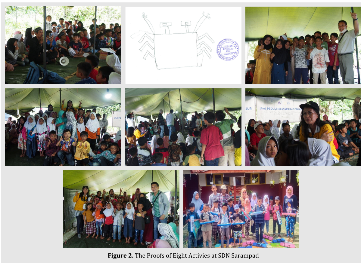
Figure 2. The Proofs of Eight Activies at SDN Sarampad

3. Growth: the music for healing activities and learning without gadget can be a growing mindset and soul activities for teachers. Students can play pianica to increase their music abilities after the earthquake. The details of growth activities can be seen below: