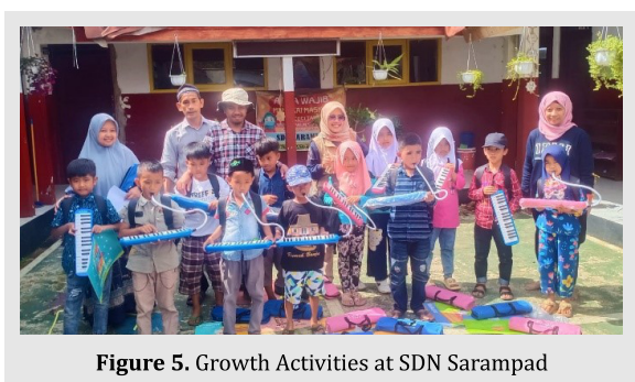
Figure 5. Growth Activities at SDN Sarampad

Therefore, the activities are continue to be monitored, the following picture was the proof of the effectiveness of the program. Students can learn again and improve their ability in music in the future.