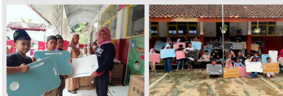
Figure 3. Existence Activities at SDN Sarampad