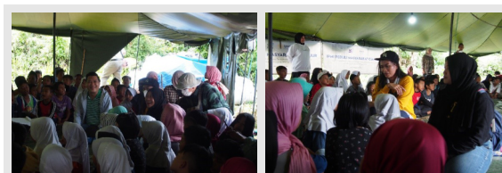
Figure 4. Relatedness Activities at SDN Sarampad