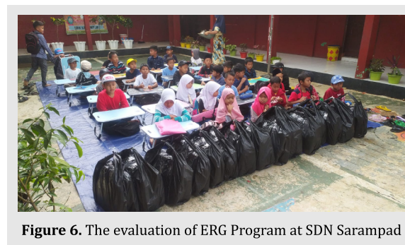
Figure 6. The evaluation of ERG Program at SDN Sarampad

As the feedback or evaluation, the students and teachers were really happy with the ERG activities. The questionnaires were distributed on the spot and mostly gave the point of "Very Helpful", and none gave the term of "unhelpful".