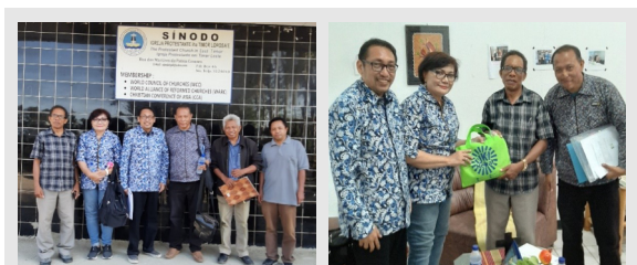
Figure 2. Group Photos after Discussion