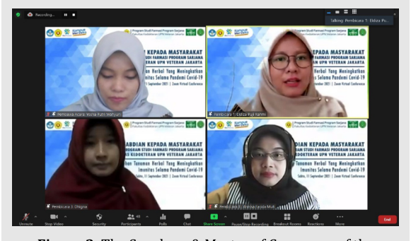
Figure 3. The Speakers & Master of Ceremony of the online counselling activities